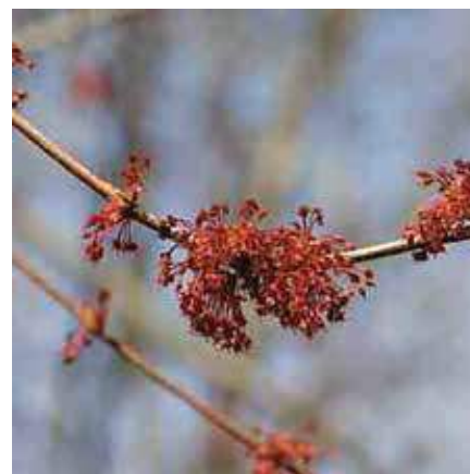
red maple Acer rubrum