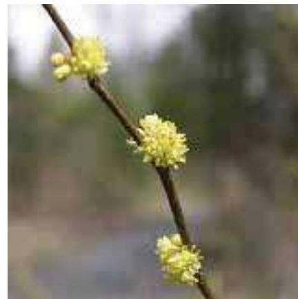
spicebush Lindera benzoin