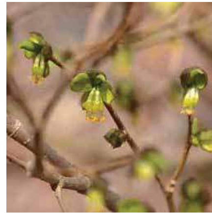
leatherwood Dirca palustris