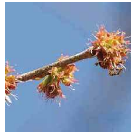
slippery elm Ulmus rubra