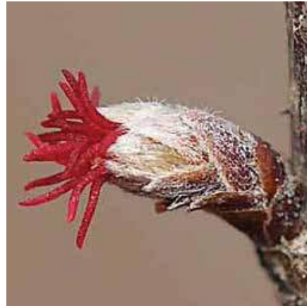
American hazelnut Corylus americana