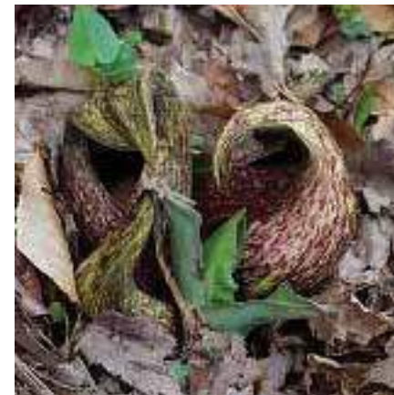
skunk-cabbage Symplocarpus foetidus