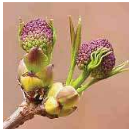
red elderberry Sambucus racemosa