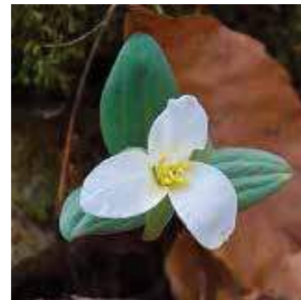
snow trillium Trillium nivale