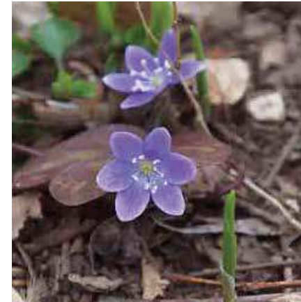
round-lobed hepatica Anemone americana