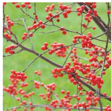
winterberry Ilex verticillata