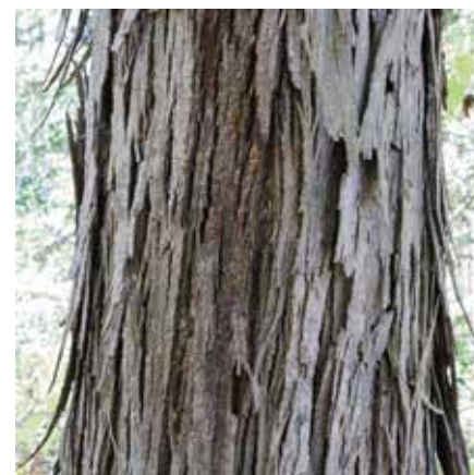
shagbark hickory Carya ovata