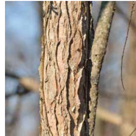
Kentucky coffeetree Gymnocladus dioicus