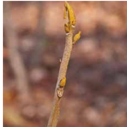
bitternut hickory Carya cordiformis