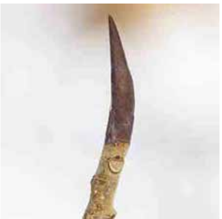
umbrella magnolia Magnolia tripetala