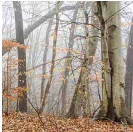
American beech Fagus grandifolia

In winter, a peaceful walk through the woods reveals fruit, trees, shrubs and the skeletons of plants that offer food and shelter to wildlife during the challenging winter season. Buds on the trees and shrubs promise that the cycle will begin again in spring.