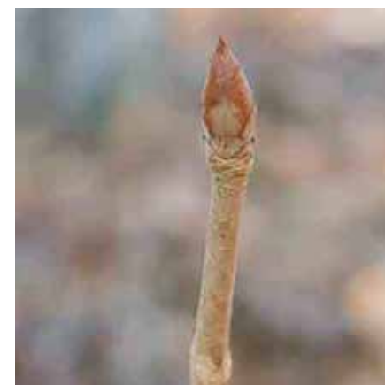
yellow buckeye Aesculus flava