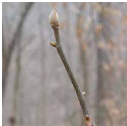
mockernut hickory Carya tomentosa