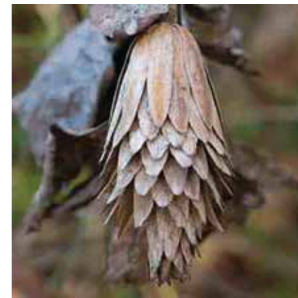
tuliptree Liriodendron tulipifera