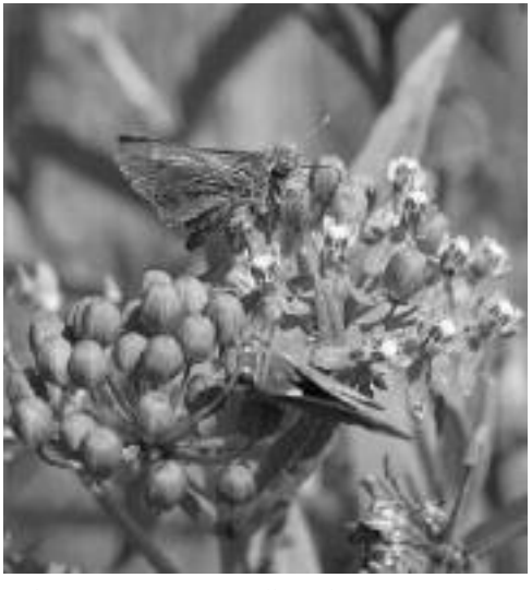
a skipper visits swamp milkweed, Asclepias incarnata

Warm Season grasses have become very trendy with managers of parks and conservation lands. What characterizes this group of species? How do they differ from other members of the Poaceae? We will discuss physiology, anatomy and evolution in order to understand their ecological role. Using live material and keys in The Plants of Pennsylvania by Rhoads and Block, we will identify representatives of the more common genera. We will also visit the meadow at the Preserve to see the plants in situ.